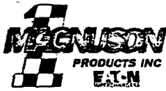
Exhibit A (E.O.# D-488-7)